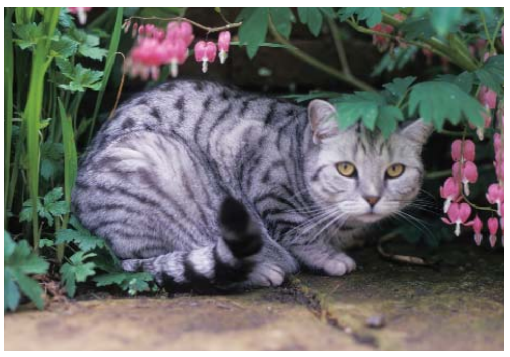
Cats look innocent but kill around 50 million garden birds each year. Those with bells or sonic devices kill 40% fewer birds than those without. Dave and Brian Bevan

Many gardens are visited by cats and it is important to help guard your birds against their unwelcome attention. Position bird feeders and tables away from the low cover in which cats may hide and also provide perches nearby - vantage points from where birds can detect an approaching cat. Anecdotal evidence suggests that the more birds that visit a garden, the lower the chances of a cat being able to catch any one individual probably because there are more pairs of eyes looking out for potential threats. Sonic cat deterrents can work well but should be moved around the garden on a regular basis so that the cats don't learn how to avoid the triggers. If you are a cat owner, consider attaching a bell or sonic bleeper to your cat to warn the local wildlife of its approach.