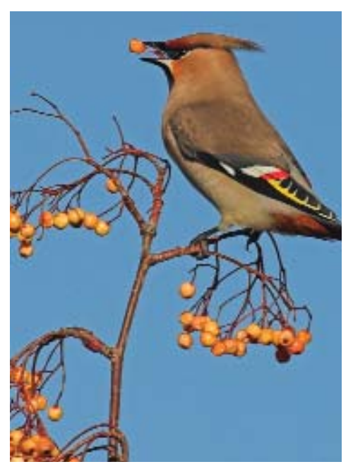
Everyone hopes to get a waxwing in their garden one day!