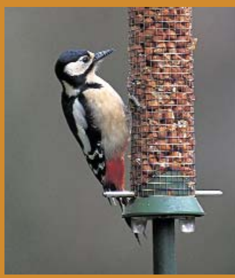
Great spotted woodpeckers are flourishing i Britain at the moment. Chris Gomersall

Easily-recognised, the blackcap is another recent arrival in many gardens where it searches out winter berries,