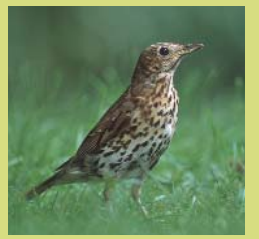
The decline of the song thrush may be linked with the use of slug pellets. Chris Gomersall

Although song thrushes are still found in many gardens, their numbers have dropped by nearly 60 per cent in some