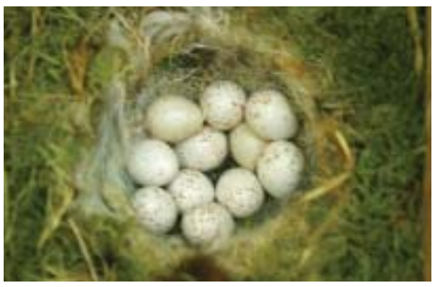
These eggs could in theory give rise to 1,000 blue tits in a few seasons! Dave and Brian Bevan

The number of young produced by songbirds takes account of the fact that most will not last long. A pair of blue tits, for example, might rear as many as 10 chicks in a season. If all these were to survive and breed the next year and if all their offspring did the same, the original two birds would be the great-grandparents of more than 1,000!