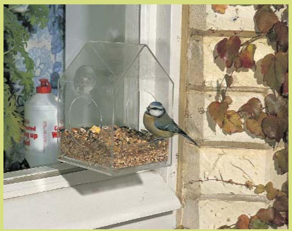
Blue tits on window feeders can be watched at close quarters.

brings birds to gardens or tried to look at your garden through their eyes? This leaflet is not a field guide but will help you see your garden from a bird's perspective. We hope it will inspire you to do what you can to make your garden, whatever its size, even more attractive to birdlife.