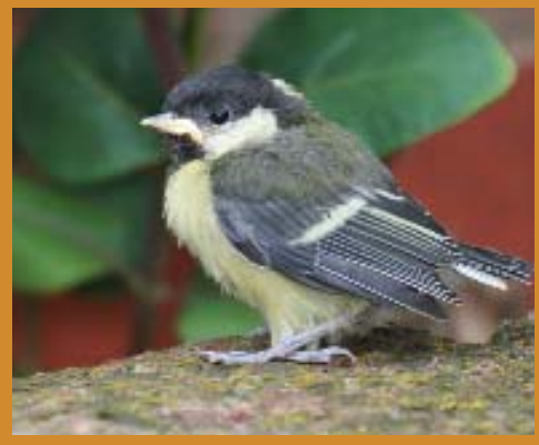
Young birds like this juvenile great tit should be left alone if found in your garden.