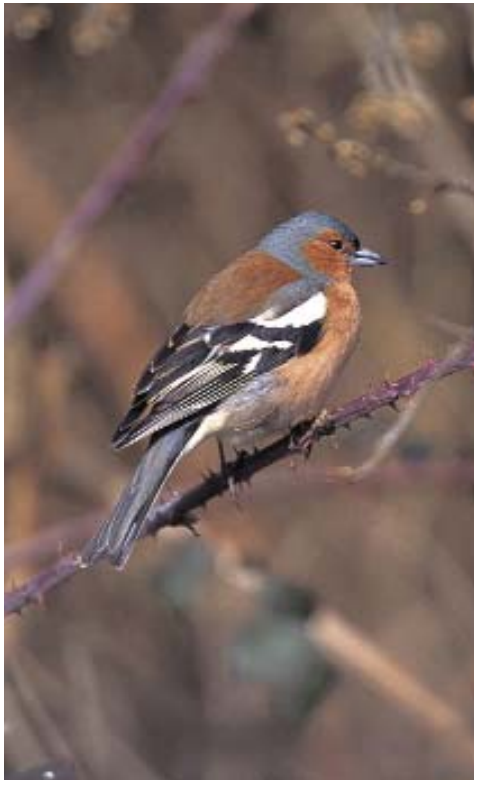
Like many birds, chaffinches switch from eating mainly seeds to a diet of insects in the spring and summer. Chris Gomersall

as tits and woodpeckers also include vegetable food in their diet and blackcaps are also very partial to winter fruits and berries. Correspondingly, in the first week or so of their lives, the nestlings of most seed-eating birds need the protein provided by insects and other