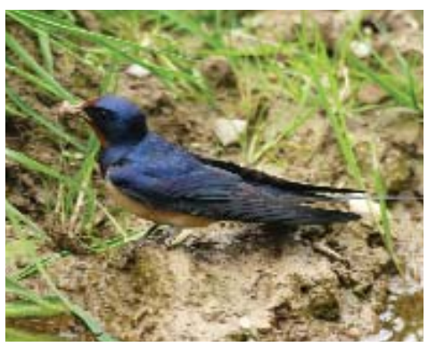
Swallows also appreciate our help with nest construction. Dave and Brian Bevan

swifts eat only flying insects and have come to depend on humans for nest sites. Whereas house martins build their cup-shaped structures of dried mud under the eaves of houses, swifts need access to roof spaces for their very basic nests. The design of many modern houses, however, often excludes swifts and the numbers of these astonishing and most aerial of all birds are falling in many areas. It's been estimated that UK population of swifts has fallen by a third in the last 12 years! You can help reverse this process by erecting special swift nest boxes or, if you have an older house,