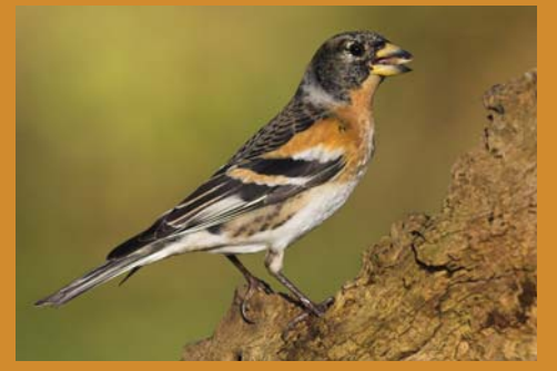
Top: Redwings are among the many birds that eat hawthorn berries. Chris Gomersall Centre: Woodpigeons go to great lengths to get at ivy berries! Chris Gomersall Above: Up to two million bramblings may overwinter in Britain. In gardens, they go for premium seed and peanut granules. Paul Keene/Avico Ltd