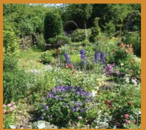
Gardens can offer a huge range of feeding and nesting opportunities for birds.

Ideally, plant them out in the autumn allowing at least half a metre between each shrub. Plan for the hedge to be at least one metre thick although if you have the space, a wider hedge will be even more valuable. The following spring, cut them back severely to encourage growth near the base. It may be hard to bring yourself to do this, but when you see the results you will be glad you had the courage! In two to three years, your originally spindly plants will be bushing out nicely. In five years you will have a thick hedge and in six or seven you may need an electric trimmer to keep its growth