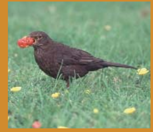
Female blackbird with cherries.

will come to expect – and even demand! – their ration. Blackbirds can be very intolerant of the presence of other species in gardens when they are feeding, sometimes being so intent on depriving others of the chance to eat that they miss out themselves. Gardens are hugely important for blackbirds, with perhaps one quarter of the population living close to human settlements. The cup-shaped nest can be made in a bush, in ivy against a wall, on buildings or in trees. Its grass lining normally distinguishes it from the mud-lined nest of a song thrush.