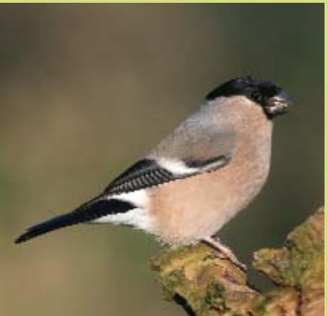
More bullfinches are now coming to gardens. The male is shown top.

Bullfinches once had a price on their heads, with a penny awarded for every one killed, because of the damage they were alleged to cause to fruit crops. Now, however, they have become scarce in some parts of the country, probably because of the huge loss of hedgerows. However, numbers coming to gardens seem to be increasing and they are showing a newly-developed taste for sunflower seeds.