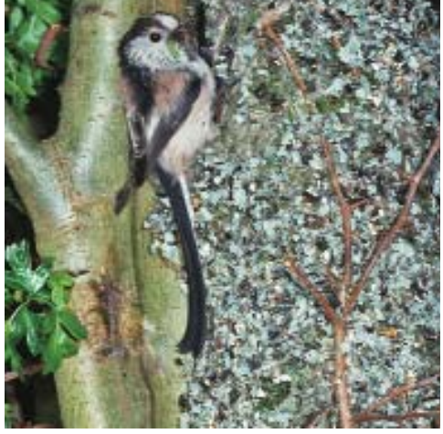
Top: Green woodpeckers often visit garden lawns in search of ants. Paul Keene/Avico Ltd Above: The nest of the long-tailed tit is an amazingly elaborate structure and may contain 2,000 feathers! Dave and Brian Bevan Right: There are few finer sights in the garden than a goldfinch in flight. Dave and Brian Bevan