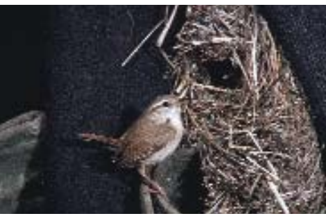
Top: Wren's nest in garlic. Above: Wren's nest in coat pocket.

hard each year to encourage renewed sturdy growth. The addition of ivy Hedera helix will benefit a whole range of invertebrates and provide extra cover and shelter for birds.