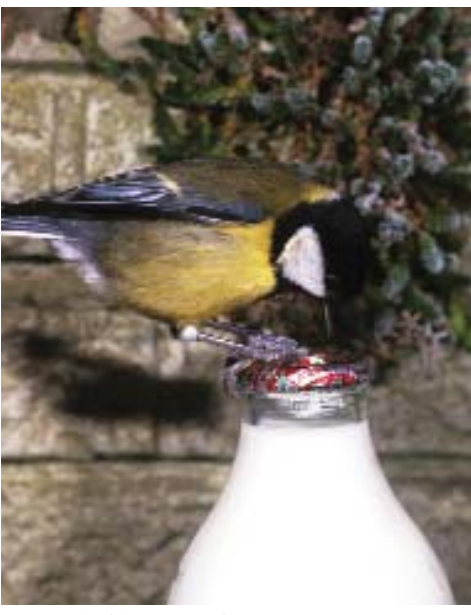
Blue tits (left) were the first species to be seen feeding from milk bottles but the habit was later acquired by the great tit (above). Dave and Brian Bevan

Ring-necked parakeets escaped from aviaries to breed in tiny numbers in the 1970s. Now, their numbers are counted in thousands and they have become regular visitors to gardens in parts of south-east England. Chiffchaffs were once rarities in gardens but now, like blackcaps, are frequently seen there in winter. For whatever reason (the most likely is food shortages in the countryside caused by intensive farming) even more species are now being seen at feeders, including longtailed tit and brambling, while others like willow tit and reed bunting are turning up in gardens in greater numbers or on a more regular basis.