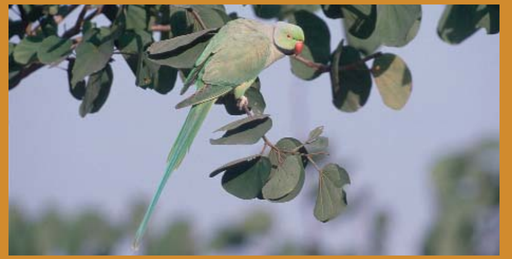
Ring-necked parakeets may become a threat to native hole-nesting species.

Observations of garden birds by tens of thousands of people give organisations like the British Trust for Ornithology (BTO) invaluable information on trends in bird populations. Only with this knowledge can we work out plans to conserve our birds for the future. If you can recognise the common garden birds you can help too.