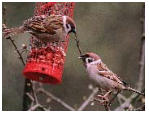
Tree sparrows are now a rarity in many areas.

The number of tree sparrows has been unstable for a very long time. It's not yet clear whether the current crash in the population – down 87 per cent in the 24 years to 1996 – is part of a normal cycle or, as is thought more likely, an anomaly that should be a cause of great concern. Tree sparrows, close relatives of the more familiar house sparrow, still come to some rural gardens and may nest in roof cavities or other holes, but in many parts of the country they have become great rarities.