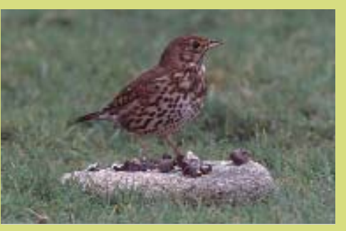
A flat stone on a lawn makes an ideal anvil for a song thrush.

Song thrushes are great garden allies as they eat large numbers of snails, first smashing their shells to get at the animal inside. To help them, make sure your garden has a suitable 'anvil' in a place where thrushes have a reasonable chance of seeing an approaching cat. A paving slab or rock placed in the centre of a lawn is ideal.