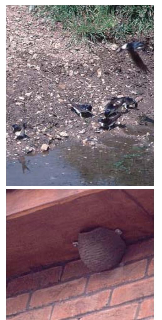
House martins need mud to make their own nests (top) but may sometimes be attracted by a prefabricated version (above).

nest on houses, the only exceptions being a few colonies on cliffs and under some bridges. Artificial nests may attract them but a local source of mud, their essential nesting material, may be more important. Like house martins and swallows,