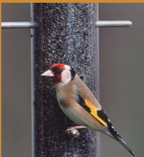
Top: Chaffinches, greenfinches and coal tits are among the species that will come readily to bird tables. Above: Goldfinches love nyjer seeds.