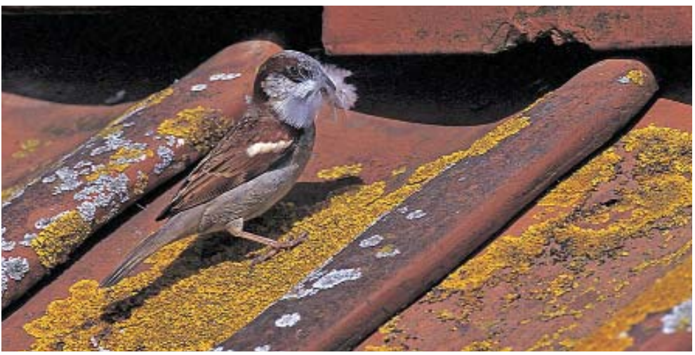
A house sparrow living up to its name. Chris Gomersall