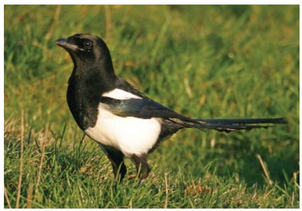
Magpies are another current garden success story.

last 50 years colonised even the centres of large cities. They will eat almost anything including invertebrates, grain, fruits and carrion – as well as small mammals and the eggs and chicks of songbirds. However, there is no evidence that they have contributed to the declines in the numbers of other species. Together with species such as coal tit, nuthatch and jay, magpies share the habit of hoarding food, in their case burying items in the ground in a hole excavated for the purpose.