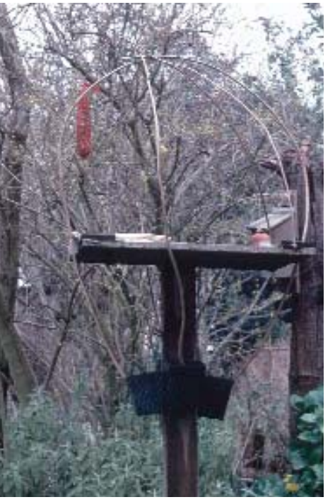
Structures like this can help to protect bird tables from cats.

Clearly, this does not happen. The harsh reality is that most young birds will die within their first year, falling victim either to hunger, cold or to a predator, whether cat or bird. Surprisingly, none of this predation seems to have an effect on overall bird populations despite the fact that cats take an estimated 50 million birds a year in British gardens.